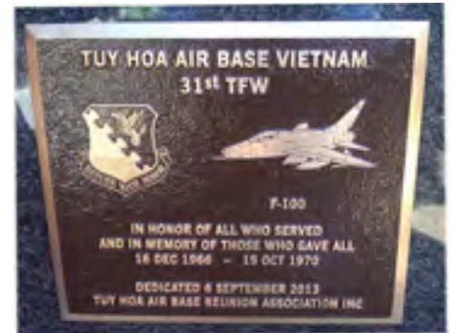
United States Air Force Museum Memorial Park located at Wright - Patterson Air Force Base in Dayton, Ohio