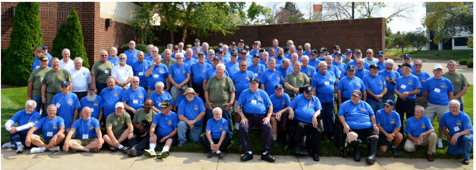
Tuy Hoa Reunion Association Veterans gather for a group picture at the 2013 Reunion held in Dayton, Ohio.

At the 2013 Reunion in Dayton, Ohio, we set a record for attendance of any of our reunions. We had 104 Veterans registrations prior to the event and an additional 7 Veterans registering upon arrival. We had 67 Spouses, Significant Others, friends and family in attendance. We had an unprecedented 51 First Time Attendees.