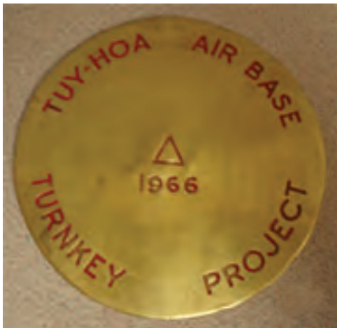
This is an enlarged photo of the small Round Brass Plate featured on the Tuy Hoa, Vietnam Memorabilia Plaque.