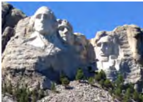
Mt Rushmore near Rapid City, South Dakota

This year's Reunion is an opportunity to see some of the history and beauty of the Old West. And as always, the event highlighted by the gathering of old and new friends. The Reunion Committee did some exploration of the Rapid City area in September 2014 and found numerous activities for our members and guests to experience in the "Geographic Center of the United States. Rapid City is truly a gorgeous example of this part of the United States with the beauty of State Parks, Monuments and Memorials.