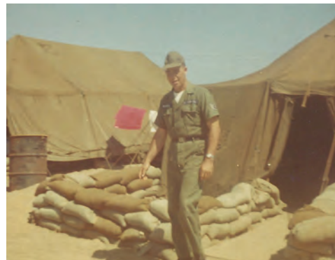
Tents and Sand Bags in the beging at Tuy Hoa

I was a Staff Sergeant with an Administrative AFSC, but it didn't matter what your skill was, we filled sand bags, erected tents and bunkers and anything else that was needed. We took out details of vehicles to pick up supplies, etc from Navy vessels that would arrive. In those days we caught a ride on a vehicle that would take us to eat with Army in their location. We ate and returned to do whatever we were assigned to do.