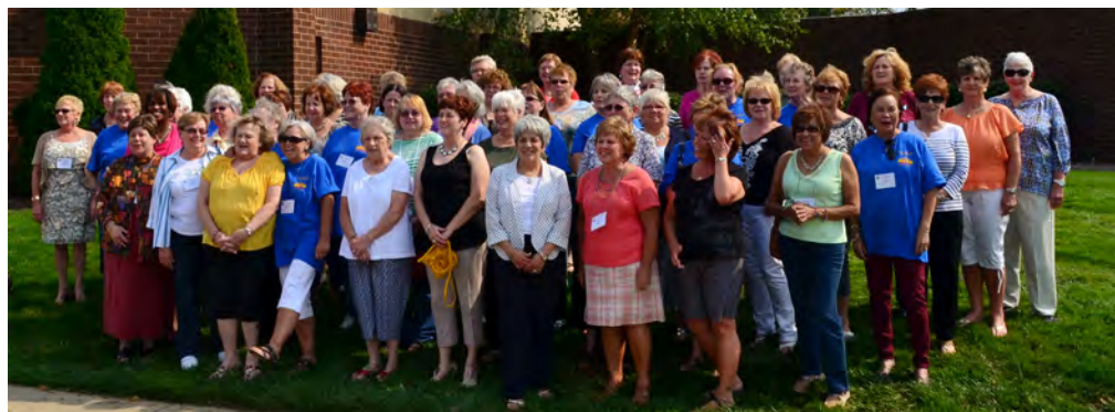
The Ladies of the 2013 Tuy Hoa Reunion Association take a moment from their busy schedule for a photo-op.

To all that donated items and also those that bought auction items, we truly Thank You .