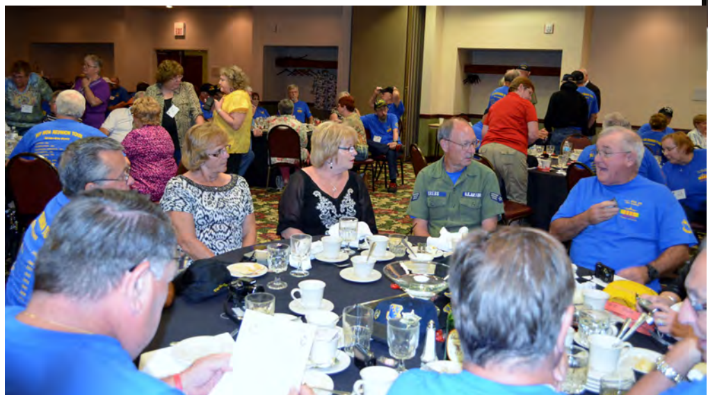
Old and New Friends enjoy some post-dinner conversations at the Dayton, Ohio 2013 Tuy Hoa Reunion.