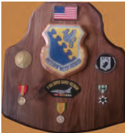
This Auction item, included the Plaque made by Don Wozniak, an 8" x 10" photo of the plaque and a letter explaining how the Turnkey project round brass plate was acquired.

Finally, it was decided that a Plaque featuring a variety of Vietnam Memorabilia would be crafted. After it was completed the names of the Arizona group were etched on the plaque.